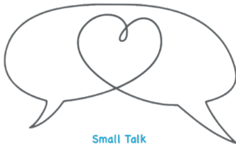
Small Talk Speech, Language & Literacy Centre

We offer a range of speech pathology services aimed at maximising your child's speech, language, literacy and learning.