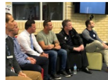
Class of 1999 mentors, visiting current Year 11 students